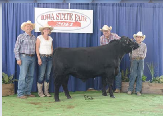
EZ Boxcar Willie 3A, sire of several West End Farms consignments

Lot 49A: Fullblood bull calf born 5/28/18 sired by ETC Cass FM 29080. Here's another young Boxcar Willie cow out of a the big Bar J Terrie cow family.