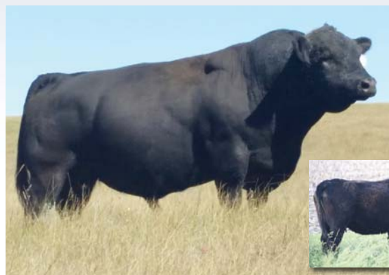
Bonanza's Boxcar 3Y, sire of Lot 13

Lot 13A: Fullblood bull calf AWC11F sired by WBA Red Rush FM31443 born 4/18/18 BW: 45#. This young Boxcar daughter has an exciting, clean made fullblood bull calf at side.