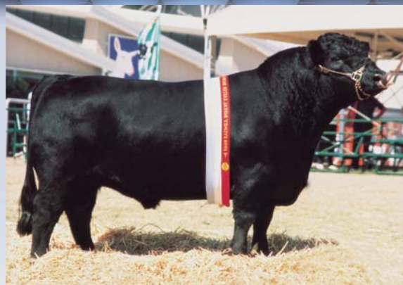
Quartermaster, sire of Lot 44

Lot 44A: Fullblood bull calf SSB08F born 4/4/18 sired by Dakota Pride FM647 BW: 46#. A rare opportunity to acquire a direct fullblood daughter of the foundation herdsire Quartermaster.