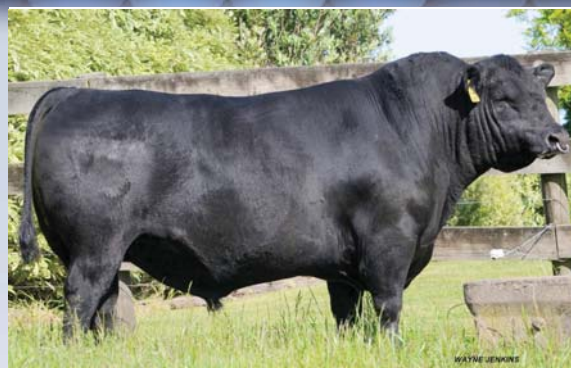
ETC Cass, sire of several West End Farms calves, is sired by Androssan Orient, pictured above.

BELL BRAE BORIS BR BOBBI JO 004H ADMIRAL J222 GLEN INNES K485 QUARTERMASTER Q117 EZ MATILDA 06G