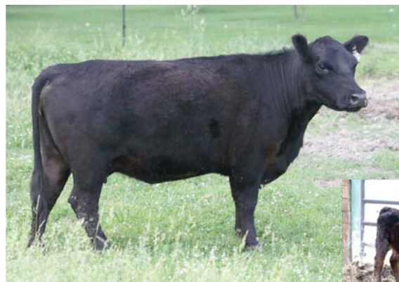
Lot 14, 14A inset

Lot 14A: Fullblood bull calf AWC09F born 3/2/18 sired by Red Rewind born 3/2/18 BW: 45#. She was AI bred to MCR All Jacked Up 5/15/18. This long bodied Doctor Love cow should have a great All Jacked Up calf next year.