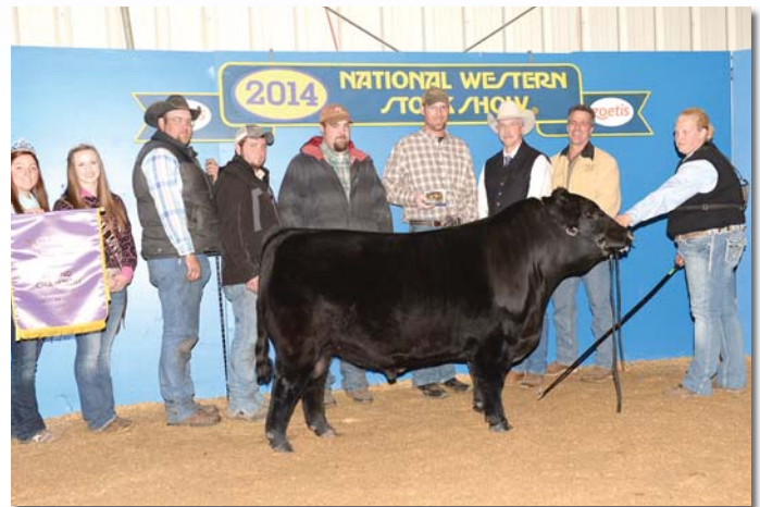
RF Imperial, sire of Lot 10

Lot 10A: Fullblood bull calf RF159F sired by Impressive born 4/27/18. She is the mother of RF Eve, lot . She is a young daughter of the National Champion Imperial. If we were not sizing down our herd, Beth would not be for sale. She is pasture exposed to Riverwood Sheldon since May 17.