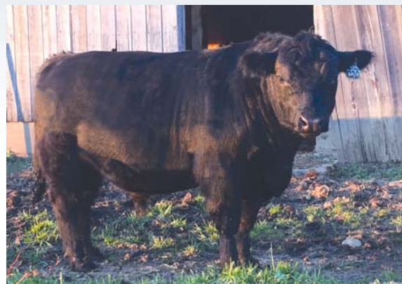
CSC Hotshot 2D, service sire for Lots 45 and 46

She was bred to CSC Hot Shot 2D FM31701 11/6/2017. Sparks and Jackaroo...two of the breed's best herdsires, all wrapped up in one great pedigree.