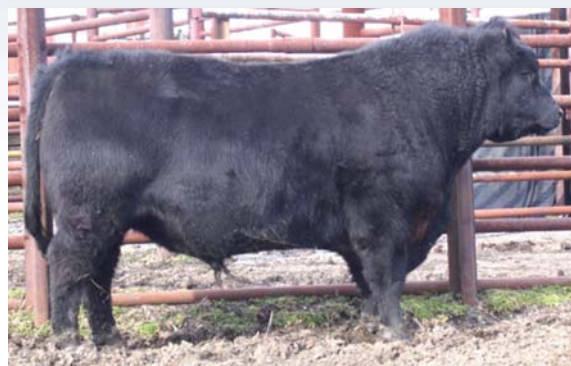
BCC Doc Holliday