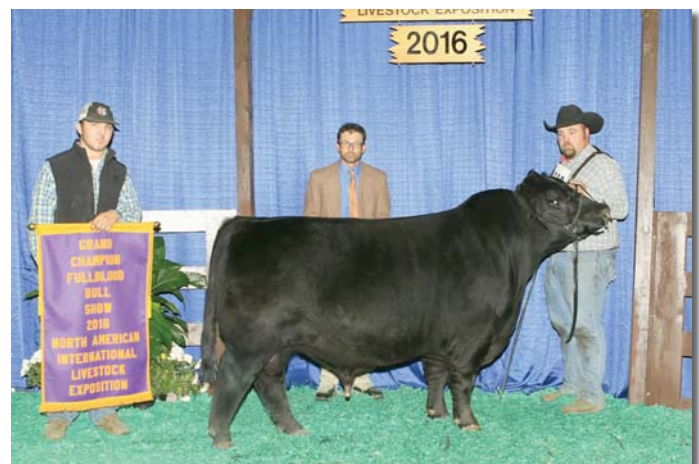
Impressive, sire of Lot 11

Right out of our Louisville show string, Eve combines Impressive, the 2 time National Division Champion and NAILE Champion with the National Champion Imperial and Keepsake, National Reserve Champion as a calf. Champion pedigree!! She is pasture exposed to Riverwood Sheldon FM15750 since May 17.