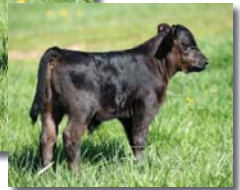
Lot 17, 17A inset