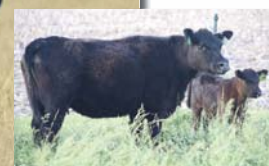
Lot 13 & 13A, inset