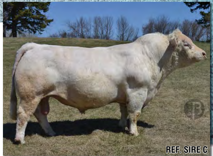
REF. SIRE C

The rising star, outcross Charolais bull in North America. His sons in our herd ranked 1, 2, 6 and 11 on the Igenity Silver program. His calves have moderate birthweights, powerful performance and great DNA.