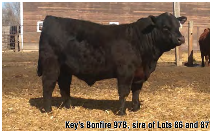
Key's Bonfire 97B, sire of Lots 86 and 87

Here's the powerful 3/8 Bonfire son out of the quarterblood OCC Provost X New Design cow. A whopping 831# weaning weight and huge yearling weight EPD's. The power is in the blood!