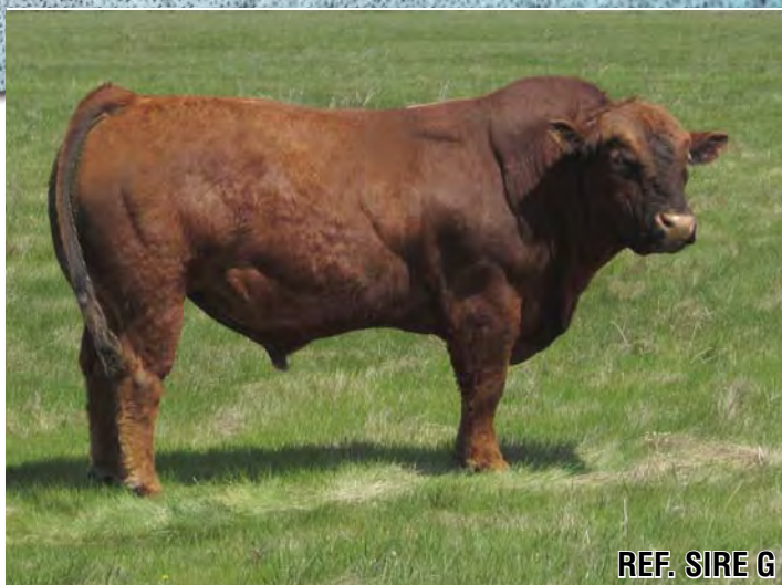
REF. SIRE G