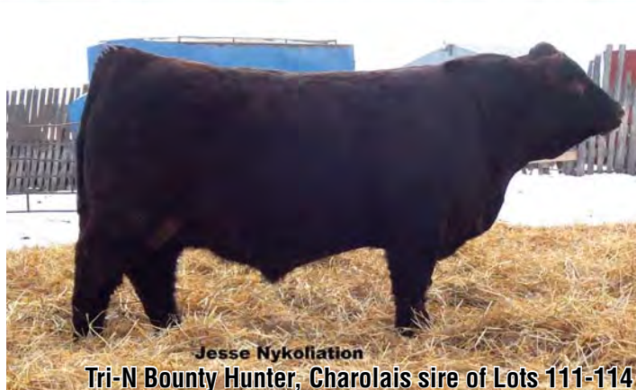
Jesse Nykoliation Tri-N Bounty Hunter, Charolais sire of Lots 111-114

This black polled half Charolais bull has power in the blood! Bounty Hunter (red Charolais) on the high marbling Direct Fire 18Y (Salers) and the high marbling Angus genetics of Summit Crest True Grit!