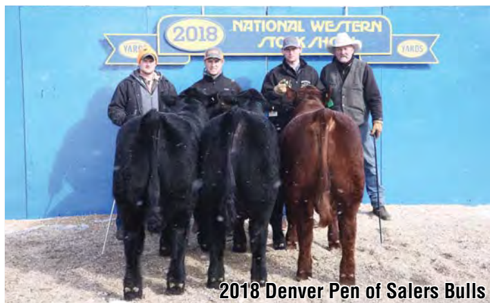
2018 Denver Pen of Salers Bulls

Look, look at this red polled low birth, high growth son of the consistent high marbling sire, Direct Fire 18Y. He looks like a "Sure Fire" herdsire and has the low BW, high WW and EPD's to back it up.