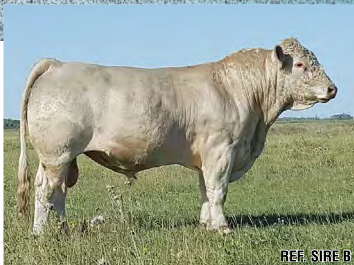
REF. SIRE B

This is his first calf crop and they look great with tremendous length of body and they come easy. He is good footed and so are his calves. His daughters should be terrific, he is out of a super cow.