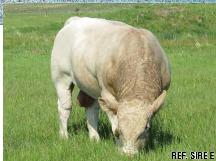
REF. SIRE E

This powerful, deep ribbed, deep quartered Canadian bred herdsire is really long with a quiet disposition. He consistently sires some of our top performance bulls – big bodied and beefy. He's a TT for Leptin. He sires outstanding females.