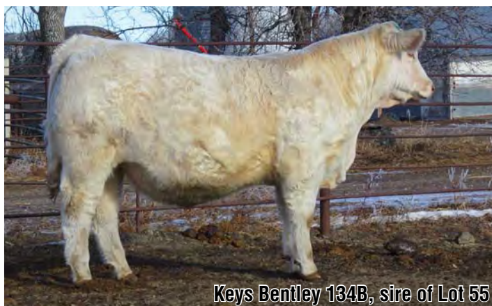
Keys Bentley 134B, sire of Lot 55

Here's a top notch bull out of a 13 year old cow who never fails to bring home a top calf. This is the only Bentley bull in the sale and he's a great one with excellent growth and performance.