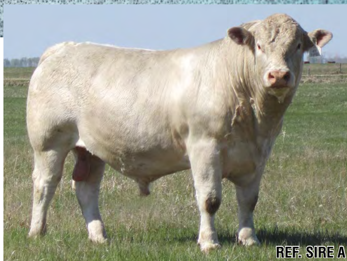
REF. SIRE A

Maximizer is our impressive herdsire with tremendous calving ease whose calves are truly on the mark. Both heifer and bull calves come easy, have excellent growth and a terrific look. Great numbers and a TT for Leptin. Co-owned with Cardinal Charolais.