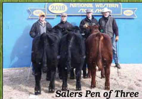
Salers Pen of Three