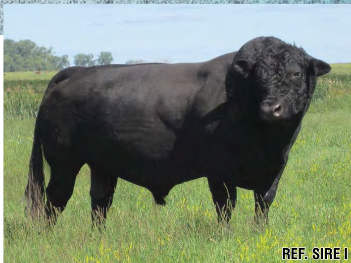
REF. SIRE I

Direct Fire sires moderate, easy fleshing bulls and females with tremendous carcass characteristics with good balance and performance. His calves are above average for weaning weight and ADG and he is a moderate birth weight sire.