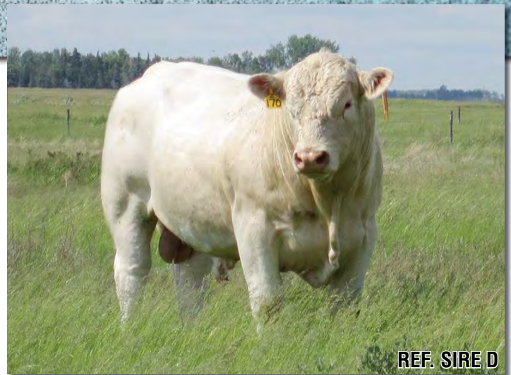
REF. SIRE D

This long-sided Bronson 2U son of our predictable donor Meg shows tremendous stretch in his high-performance calves. His daughters really milk and his sons are consistent top gainers. You've got to like their look! He is a half brother to Keys All State.