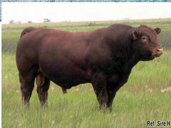
Ref. Sire H

Monument is a very well made, well balanced, good headed bull that really stamps his calves with a great look and excellent performance. He is a TT for Leptin.