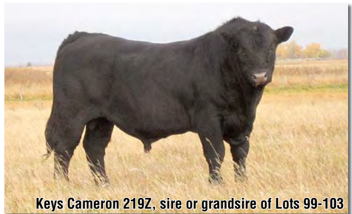
Keys Cameron 219Z, sire or grandsire of Lots 99-103

He's long bodied and that's in his pedigree. His dam has an average birthweight of 66# on 3 calves. His calves will really perform.