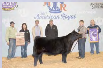
EZ Hotties Girl 46D

Here we go! Hottie's Girl, the winningest fullblood heifer on the 2017 show circuit and maybe ever in the breed is a maternal half sib to these embryos. All Jacked Up sires exceptional bulls as well as outstanding female. You can't miss here. The embryos will be shipped to the buyer at the buyer's expense.