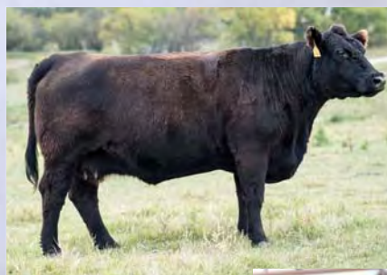
TCS Classy Beau 33X. dam of Lot 60

Here's a great ET March Cash daughter of the powerful donor TCS Classy Beau 33X. You don't find many like her and it's not a bad idea to put together as many daughters as you can out of cows this good.