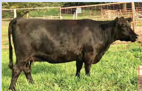
Lot 21 and 21A

Ardrossan Findon Kimbolton Daphne Brambletye Arunta Mugga Fidelity F338