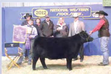
Bar J Nell 0X13, 2012 National Champion, Traces to Navigator