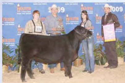
EZ Lacey 55T

These embryos are from Boxcar's sister, out of the great LTL LaSalle cow, and sired by the outcross vintage bull Greg MLP3, born in 1997. Greg sired PX Baxter, the sire of the 2007 National Champion Heifer PX08R, Baxa and WMF Under Cover. Greg also sired one of our top fullblood bulls in our sale this year.