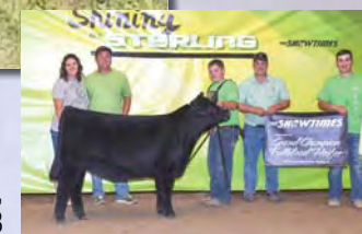
EZ Hotties Girl 46D, paternal sister to Lot 3B