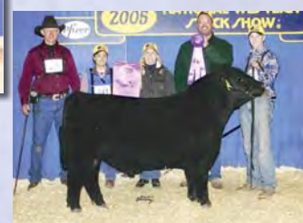
LTL Dillon, 2006 National Champion Bull