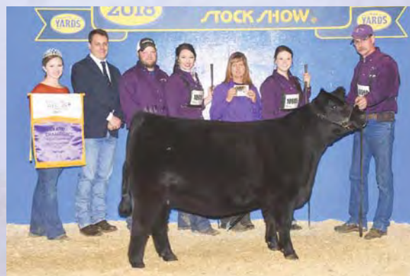
TCS Erica PC 15D, 2018 Denver and Houston Supreme Champion