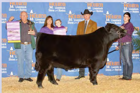
JH Mr. Jack 5A, Supreme Champion at Houston Stock Show

26E is a real pretty open 3/4 Mister Jack 5A X Beau - Erica combination that shows this really works. Her dam sells as lot 36. Open and ready to breed.