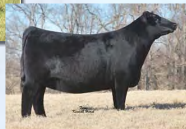
Dam of Lot 50