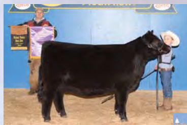
Bar J Frosty, donor

Two embryos from the 2014 National Champion Female, Bar J Frosty and the 2016 National Champion Bull, Mister Jack 5A. The embryos will be shipped to the buyer at the buyer's expense.