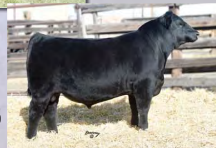
DCS Cash 1C, sire of Lot 60