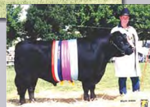
Roulette, sire of the embryo carried by Lot 15