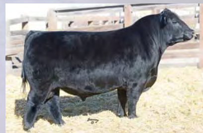
MCR All Jacked Up