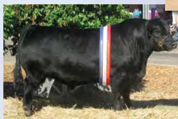
Yarra Ranges Jackaroo