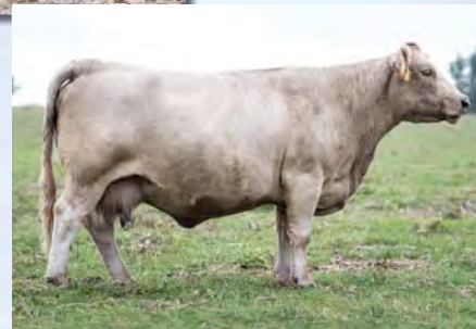
HH Devine Temptress, dam of Lot 58

Color: Black Tattoo: EBC85D Reg. #: MF30853 BD: 3/3/16