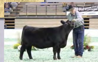
All Dolled Up, full sister to Lot 3A