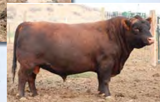
AS Jase, sire of Lots 5-6