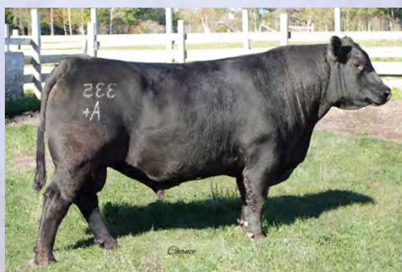
Duff Trademark, sire

Wow. She's bred to be a great one by the National Champion Mister Jack and out of the daughter of Hudson Pine's great donor B-K Bertha's Abby. She's so pretty, soft and mellow, the picture of efficiency.