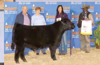
JH Mister Jack 5A, sire