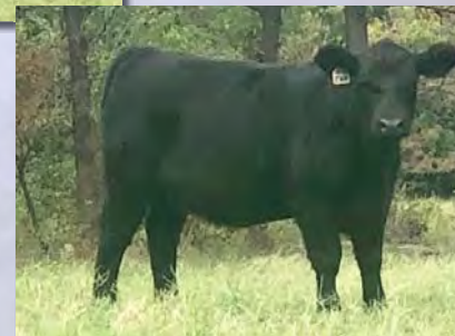
2018 Fullblood Peter daughter of Lot 2

8U7 is a donor quality cow. The only reason we are willing to part with her is that we are retaining two daughters in our herd. Her yearling Aberdeen Plus daughter was Reserve Grand Champion Percentage Heifer at the 2018 Junior Nationals and her 2018 fullblood heifer is in our show pen. Her 2016 Duff Rebar son was the high gaining bull and had the highest RFI index of all Aberdeen bulls at the 2017 Genetic Development Center Bull Test in Navasota, TX. She also has leading daughters in the Flying J & L Ranch and Bar N Ranch herds. She is due early next spring to the great MRG Peter FM15177. Take advantage of this rare opportunity to own a proven donor quality female. She sells with 5 straws of MRG Peter semen and the certificates necessary to register calves out of this cow.