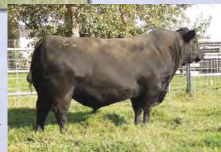
All Jacked Up, Sire of Lots 3A and 4