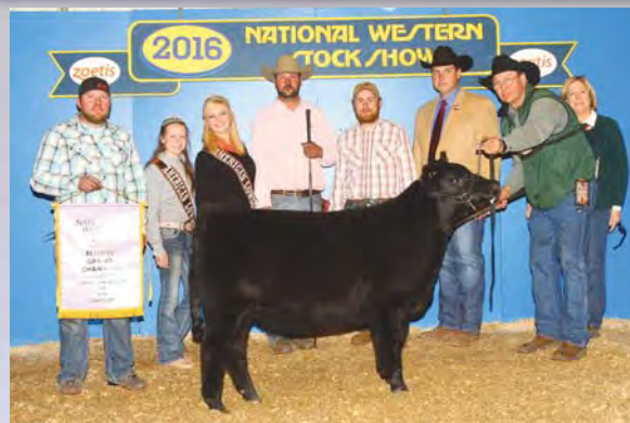
All Dolled Up, full sister to the lot 77 embryos

All Jacked Up X Tootsie 014U - the same mating that produced the 2015 Reserve National Champion Female, All Dolled Up, who topped the 2017 National Sale at $31,000 to JC Ranch. The embryos will be shipped to the buyer at the buyer's expense.