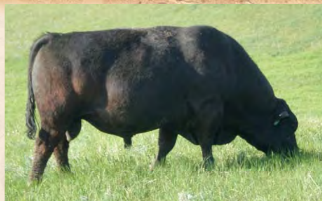
EZ Houdini 22N, sire of Lot 30 as a 6-year-old

Haddie is out of a maternal sister to Utah. She is bred to GLT Unique U02 FM8247.