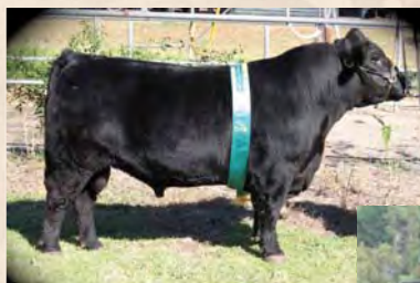
Colombo Park Zeffirelli, sire of Lot 19

Wurrung's sire Zeffirelli has great tenderness and marbling markers. This great bull is out of the fabulous Carla daughter Nardia...a tremendous Australian pedigree!