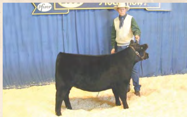
EZ Lola 15M, full sister to the dam of Lot 41

She has a pedigree laced with strong direct import genetics - Jamberoo and Zeffirelli - and bred to Perfecto has the potential for greatness. She is bred to EZ Perfecto 48X FM12079.