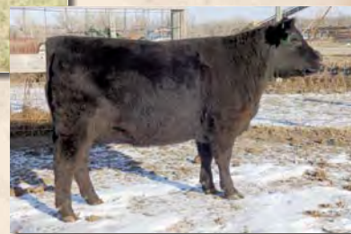
DAD Jackie A756, Lot 4's Jackaroo daughter