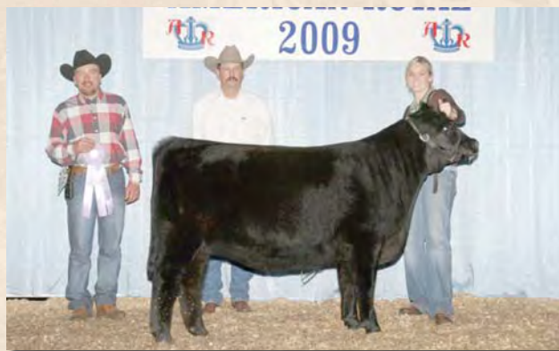
WMF Untouchable, maternal sister to Lot 27

Sadie is royally bred by the St. Louise son Lexus out of the fabulous Beau Lad daughter EZ Lady Jane 4L. She is bred to GLT Unique U02 FM8247.