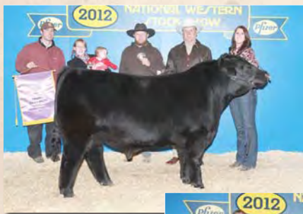
EBC Ace 2012 National Champion Percentage Bull Breeding privileges are offered.

Grant and Jaana will offer two units of semen and one breeding certificate for use on each female purchased in this sale. The buyer can choose any of the herd bulls being retained by Grassline including Bonanza's Boxcar 3Y, EZ Captain Jack 1X and EBC Ace.