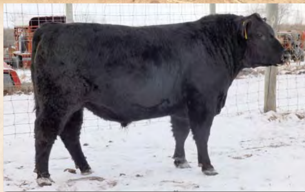
Jack Daniels, son of Lot 1

This productive 4-year-old Brick daughter has already produced a great young herd bull, Jack Daniels, shown in the 2015 National Show. She is pasture exposed to DDR LL Jack FM15421 from 6/26 - 9/25/14.