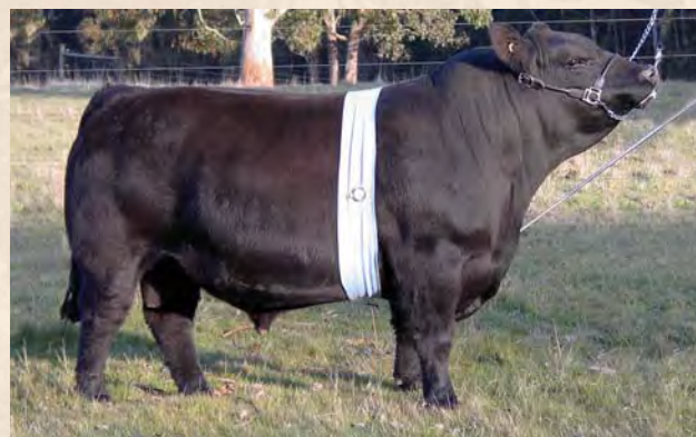
Fairlawn Rebel, sire of Lots 37 and 38

With the power of the big bodied Rebel on the top side and the maternal strength of Beau Lad and Lady Jane on her bottom side, she can do it all. She is bred to GLT Unique U02 FM8247.