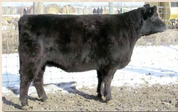
EZ Miss Pamela 9P, dam of Lot 28