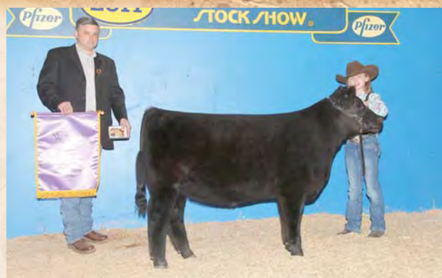
Xquisite, paternal sister to Lot 52