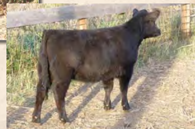
Lot 44 as a calf