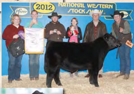
Bonanza's Boxcar 3Y 2012 Reserve National Champion Fullblood Bull Breeding privileges are offered.