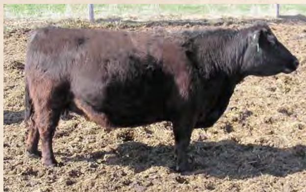
Brambletype St. Louise S208, granddam of Lot 53

St. Louise S208 genetics on the bottom side strengthen this pedigree as much as the Nevada breeding and the Australian Unique pedigree of her sire. She is bred to EZ Torch 23T FM 6319.