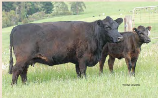
Ardrossan Nardia, dam of Lot 49

A full sister to the great Jamberoo. Her granddam Carla is one of the best looking cows in the breed. She is bred to EZ Torch 23T FM 6319.