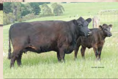
Ardrossan Nardia, dam of Lot 19