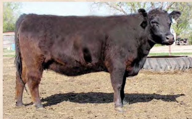
EZ Lady Luck 51N, dam of Lots 50 and 51

Here is an ET heifer out of the Reserve National Champion Lady Luck by the Australian National Champion Jackaroo who has sired numerous American champions. She is bred to EZ Torch 23T FM 6319.