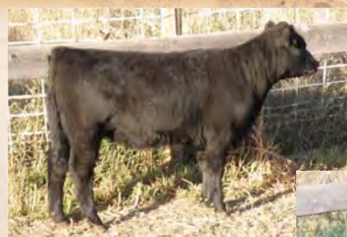
Lot 42 as a calf

This straight topped, ultra feminine Herman daughter has that extended frame to stretch out your Lowline genetics. She is bred to GLT Unique U02 FM8247.