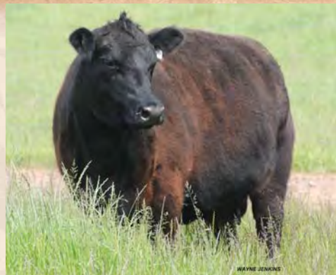
Ardrossan Tutu, dam of Lot 48

Sired by the 47", 1547# Lincoln with some of Ardrossan's best breeding on her bottom side. She is bred to EZ Perfecto 48X FM12079.