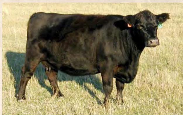
Brambletype Santa Fe S192, dam of Lot 29

Her dam is a big bodied, powerfull direct import daughter of the foundation sire Admiral J222 and the great Tara J534 cow. She is bred to EZ Perfecto 48X FM12079.