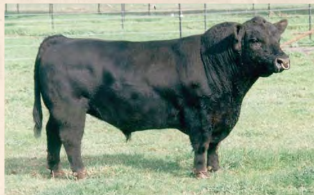
Beau Lad, sire of Lot 51

Here is an exciting daughter of the now deceased Beau Lad and the 2006 Reserve National Champion Female. Exciting genetics bred to Torch. She is bred to EZ Torch 23T FM 6319.