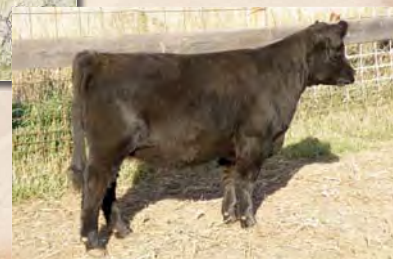
Lot 46 as a calf