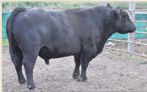
The Brick, sire of Lot 23

This 71% deep sided Brick son is ready for lots of cows or heifers.