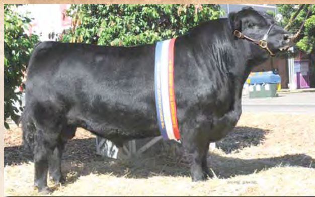
Jackaroo, sire of Lot 17

LL Jack is a complete fullblood beef sire whose calves look great – he's a Jackaroo son and with the recent death of Jackaroo, there won't be more.