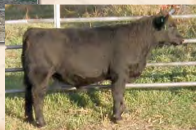
Lot 20 as a calf