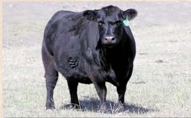
ALM Prairie 40H, granddam of Lot 7

Sweet Pod's dam Sweet Pea is out of one of the biggest bodied fullblood cows in the breed, ALM Prairie 40H. She is pasture exposed to DDR LL Jack FM15421 from 6/26 - 9/25/14.