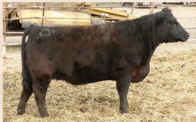
Lot 33 as a bred heifer

This Dillon daughter is only offered for sale because this is a mature cowherd dispersal. She produces the best calves! She is bred to GLT Unique U02 FM8247.