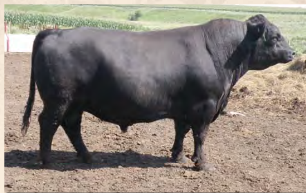
EZ Champ 34T, sire of Lot 56

This Unique heifer's mother is a full sib to our top donor cow by Dillon that sells as Lot 33. She is bred to EZ Torch 23T FM 6319.