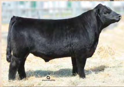
EZ Captain Jack 1X 2011 National Calf Champion Bull Breeding privileges are offered.