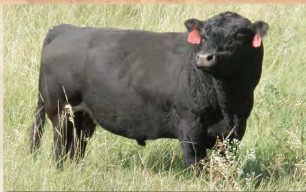
EZ Pistol 23P, maternal brother to Lot 26

This fullblood daughter of the foundation Australian sire Commander II M045 is out of the dam of the great herdbull EZ Pistol 23P. She is bred to EZ Perfecto 48X FM12079.