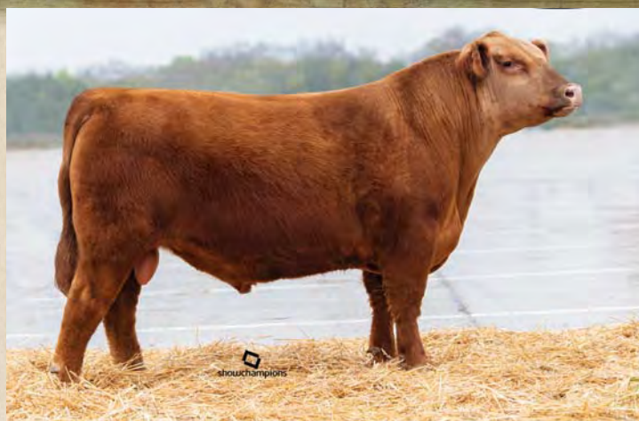
Alta Aries, sire of Lot 4

Alta Adele is an awesome black "true red" gene carrier whose dam is the prolific mother of Alta Legend, one of the best maternal sires in the breed and a top-selling red fullblood as a calf. Her sire might be the best-looking red fullblood bull out there! Great opportunity to add some top genetics!