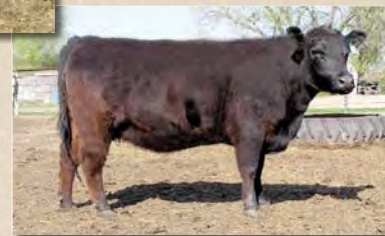
EZ Lady Luck 51N