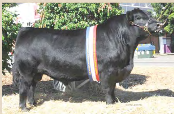
Yarra Ranges Jackaroo