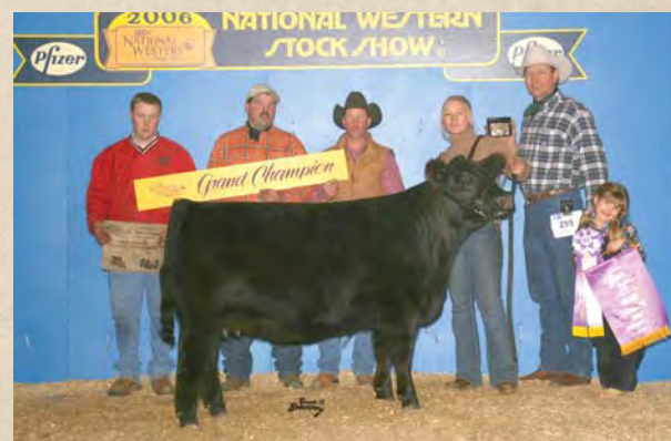
EZ Maggie 33P