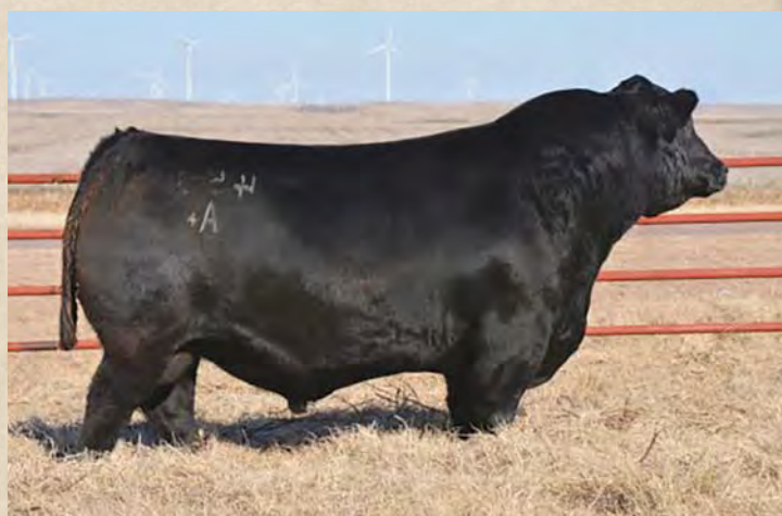
Duff Mercy Me, sire of Lot 17

Gabby is a fancy halfblood show heifer prospect by the red gene carrier, Johnnie Walker, and out of the same Spitfire cow that is the granddam of Lot 17 and is the dam of AZP Freight Train.