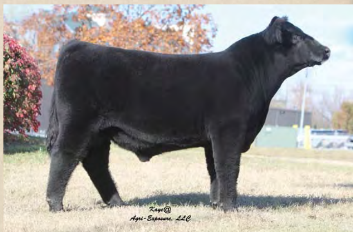
AZP Freight Train 02C, sire of Lot 15

Ruby Red is long and deep with longevity in her pedigree. Skors are retaining two flushes at their expense and the buyer's convenience.