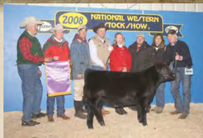
DJR's Yes I Sparkle 26T, dam