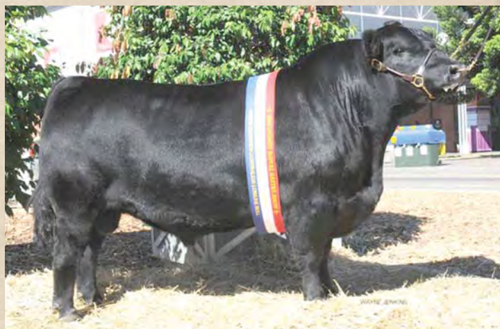
Yarra Ranges Jackaroo