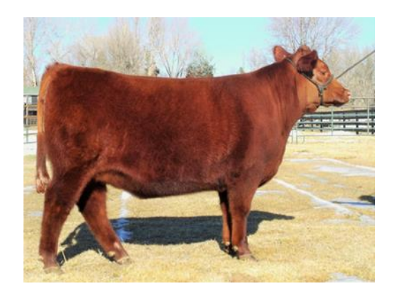
Lot 31 Reg # is MF24596

Lot 29 She is carrying a heifer calf, due 7/4/15 to Vitulus Branded Red