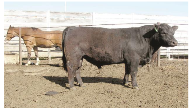
EZ Pete 14P, son of Tayla 38J

Lot 21A: 4 fullblood embryos sired by Jackaroo. 2 are out of the Reserve National Champion Lady Luck 51N and 2 are out of Tayla 38J , one of the few daughters of Rouseabout in the US. Count on longevity and high quality offspring from this bloodline. She is pictured below as an 11 year old and is still producing on the ranch at age 17! Her son EZ Pete 14P was a herd bull at EZ Ranch.