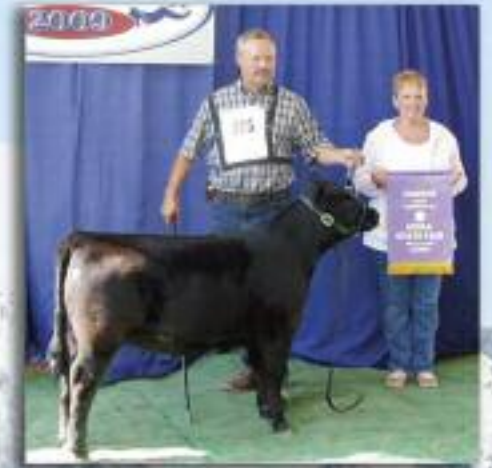
This Iowa Champion sells as Lot 5