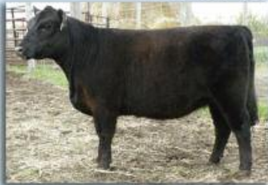
Lot 4 ~ This daughter of champions is safe in calf to Jackaroo, the two-time Australian Champion

Tuesday, January 18, 2011 • 1:00 p.m. MST National Western Stock Show • Denver, Colorado