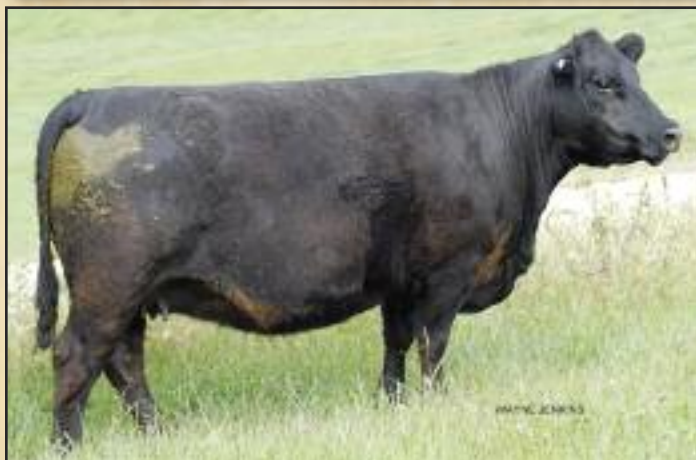
Ardrossan Isadora ~ Dam of Lot 43