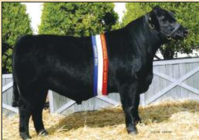
Wanamara Findon Royale (FM 7445)

ARDROSSAN FINDON FM 5082 {ARDROSSAN RICHMOND {ARDROSSAN CARLA