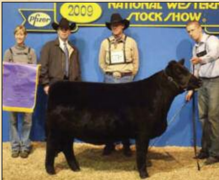
This 2009 National Champion Female is the dam of lot 23.