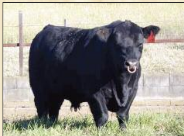
Vitulus Yes Yes Yes – Sire of Lot 2

✓ This outstanding Durango daughter is no stranger to Denver, standing 4th in her class in 2010. She's safe in calf to Ardrossan Jamberoo, that will improve your herds Genestar rating.