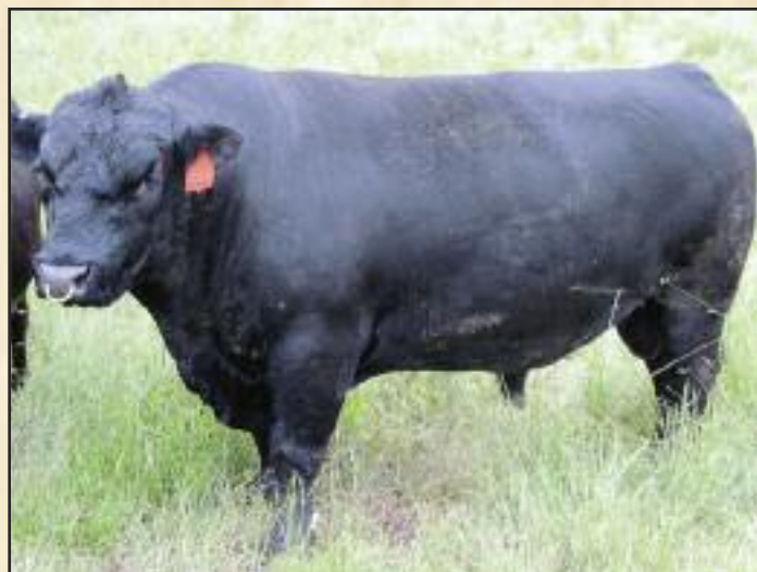
Ardrossan Jamberoo ~ Sire of Lot 46

{ARDROSSAN NERON { ARDROSSAN JAMBEROO { FM {ARDROSSAN NARDIA { {ARDROSSAN CARLA { { {TRA J037 JOCK { { KIMBOLTON HARMONY KPSW019 { { FF {KIMBOLTON MIRACLE { {