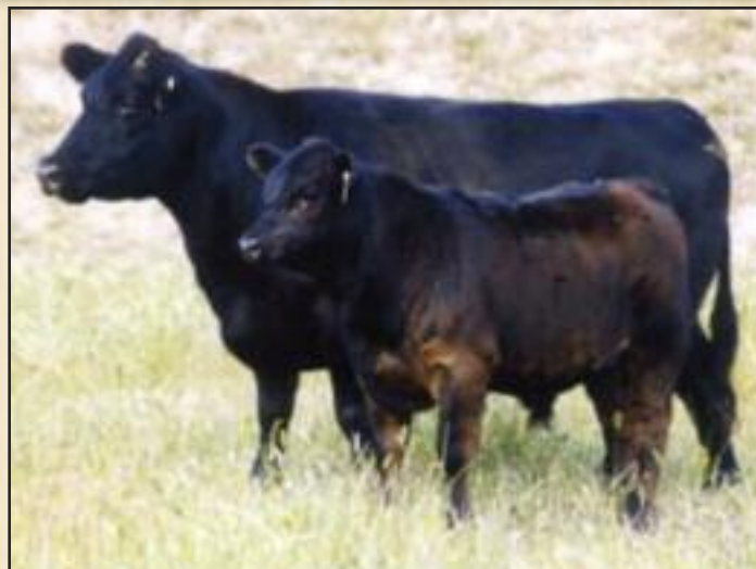
Ardrossan Carla ~ Dam of Lot 45

{BROKEN ARROW NERO BAS U90 { {BROKEN ARROW OPAL NERO ARDROSSAN TIGERTIM { {ARDROSSAN PETER FM {KIMBOLTON MIRACLE KPS-P001 { {GI J354 { { {ABF JAMES BOND L007 { { ARDROSSAN CARLA { { FF {GI J330 { {