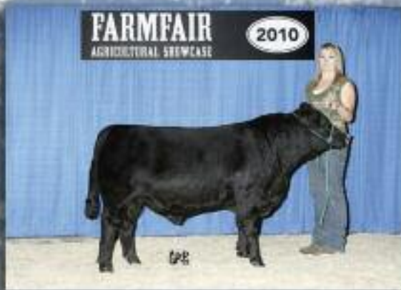
This Apollo son, selling as lot 33, is an out-cross to most American genetics.