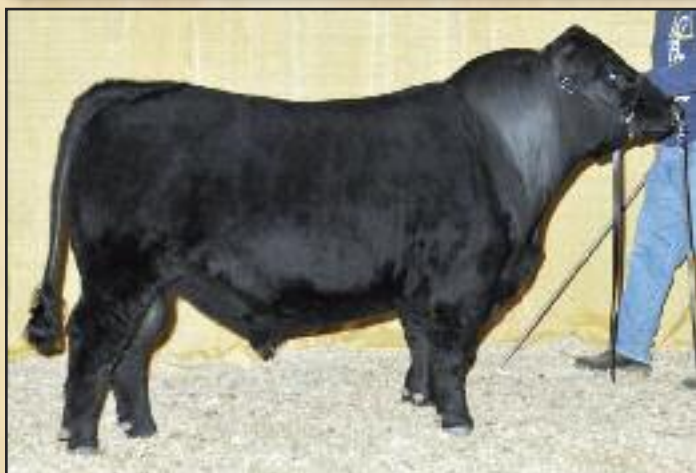
Outlaw (FM 5996)

{APPERTARRA RANDY COLOMBO PARK ZEFFIRELLI (AULM 5382) {COLOMBO PARK VIOLETTA SIRE