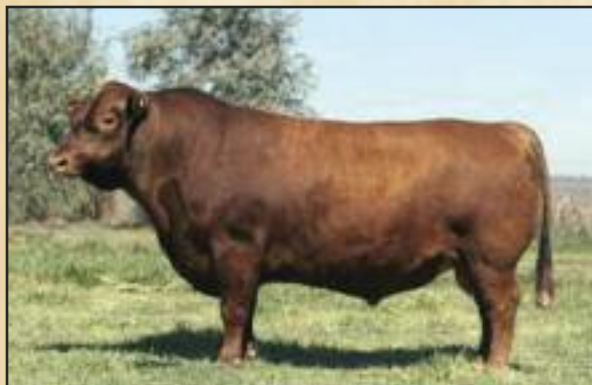
“Bluey” – Sire of Lots 40, 64 & 65 and grandsire of Lot 37