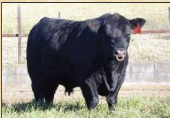
Vitulus Champion ~ Sire of Lots 49A, B & C

Lot 48B: 3 embryos sired by Beau Lad, the direct Australian import whose progeny have excelled in carcass traits and carcass DNA markers. He produces calves with tremendous style and balance that grow into exceptional show cattle.