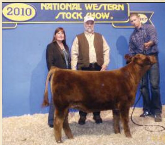
Bar J Brook 9W5 ~ Daughter of Lot 44