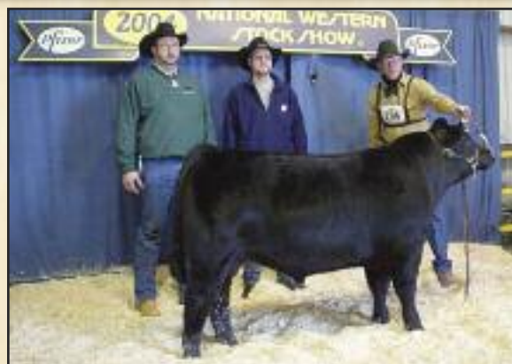
Bar J Cuervo ~ Sire of Lots 53, 54 & 55

✓ Dam was NWSS 2002 reserve champion percentage female. Pasture exposed July 1 to December 1, 2010 to Spring Creek Uriah.