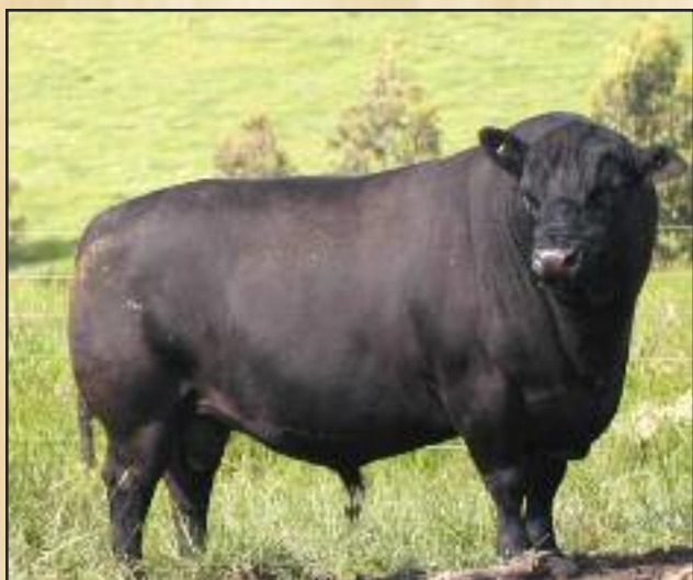
Ardrossan Richmond ~ Grandsire of Lot 47

✓ These embryos represent an opportunity for breeders to purchase something different, new and unique which will be sought after by other breeders.