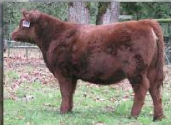
This double bred Bluey is bred similar to the 2010 high selling heifer. She sells as Lot 24.

North America's Elite Lowline Genetics!!